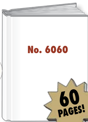
Bare Book Plus